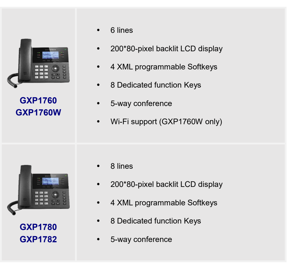
Table 1: GXP1760/GXP1760W/GXP1780/GXP1780 Features at a Glance

The following table contains the major features of the GXP1760 & GXP1780/82: